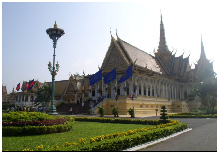
The Silver Palace

Cambodia is in South East Asia and has a population of some 13 million within an area approx twice the size of Eire. It borders with Thailand, Laos and Vietnam and is particularly known for its famous Angkhor Wat temples. Its history is very complex but briefly divides into 6 eras: Angkhor Civilisation from 800 – 1100; Serial Invasions from Vietnam, Thailand, France, Japan and USA; Self Destruction with Khmer Rouges in 1975 under Pol Pot; “Rescue” by Vietnam in 1979 when it became known as Kampuchea; “Democracy” and finally “Kleptarchy” when the king was reinstated. It is now a much more stable country but the people have suffered some terrible experiences.